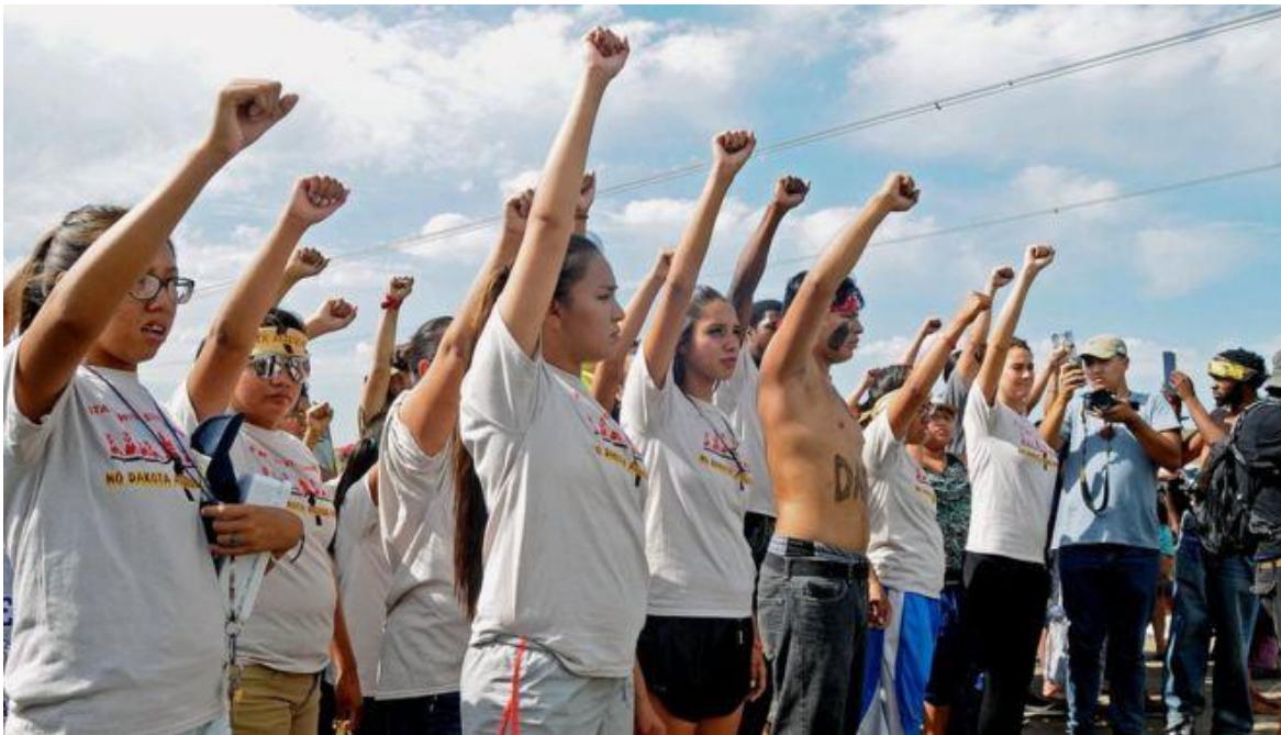
A group of Native American protesters halt work on the Dakota Access Pipe line North Dakota on August 16, 2016.

Many expressed the view that the legislation violated freedoms of expression, association and conscience. Its passage prompted even larger and more sustained demonstrations including a protest of over 100,000 people in Montréal on May 22, 2013.