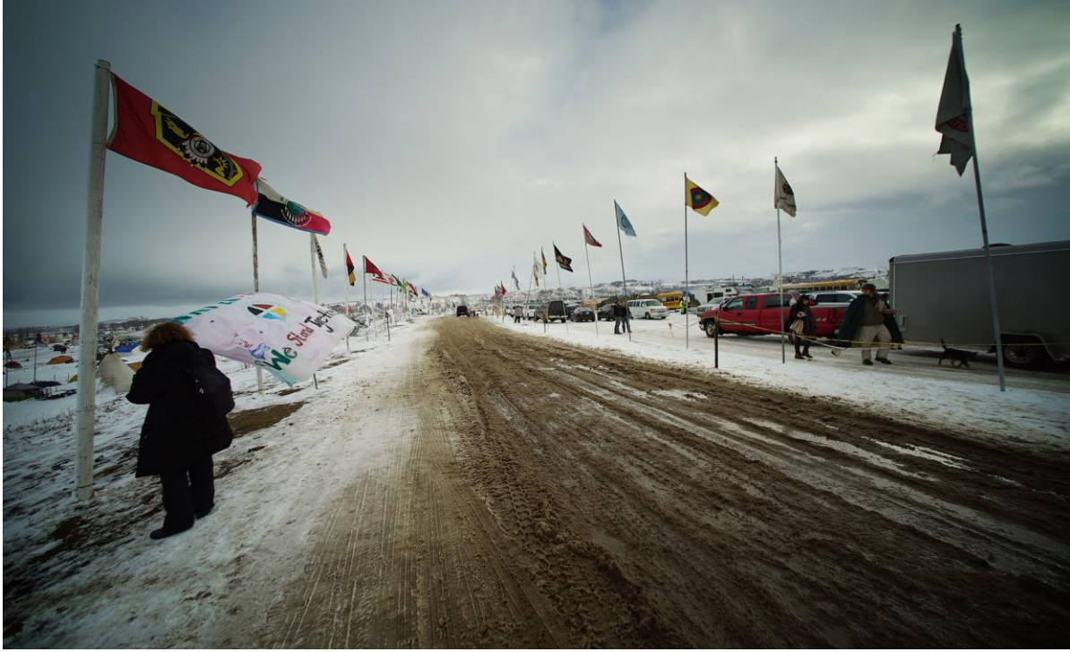
The oil pipeline protest site by the Standing Rock Reservation in North Dakota in November, 2016

On November 20, 2016 at a standoff near the Standing Rock encampment that lasted for more than six hours, police sprayed a crowd of roughly 400 protesters with water in temperatures hovering below freezing (photo below). Camp medics reported that hundreds were treated for hypothermia. Twenty-six people were hospitalized. National Lawyers Guild observers reported that several people were unconscious and bleeding after being shot by rubber bullets.