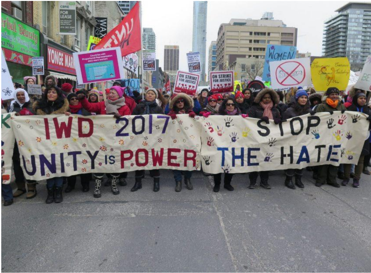
Women's Day Protest, Toronto, March 11, 2017