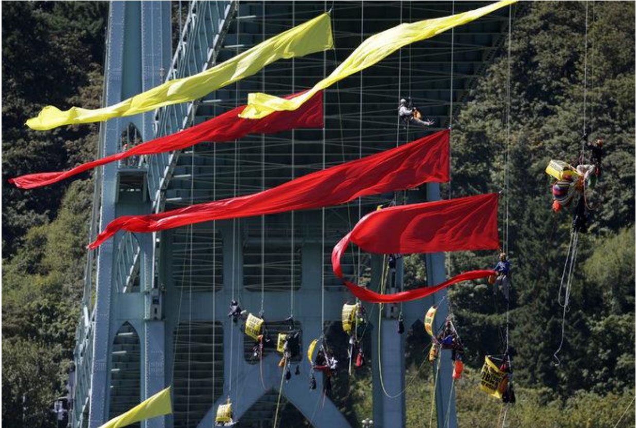
Greenpeace Activists Hanging from St. John's Bridge over the Willamette River, Portland, Oregon, to protest the departure of the Shell icebreaker Fennica en route to Alaska for Arctic Drilling, July 30, 2015

Finally, we welcome your questions, comments and criticisms. The e-mail address is lmcgrady@mcgradylaw.ca .