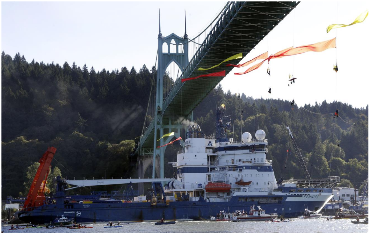
Greenpeace Protesters use Kayaks to encircle Greenpeace Activists Hanging from St. John's Bridge over the Williamette River, Portland, Oregon, to protest the departure of the Shell icebreaker Fennica en route to Alaska for Arctic Drilling, July 30, 2015.