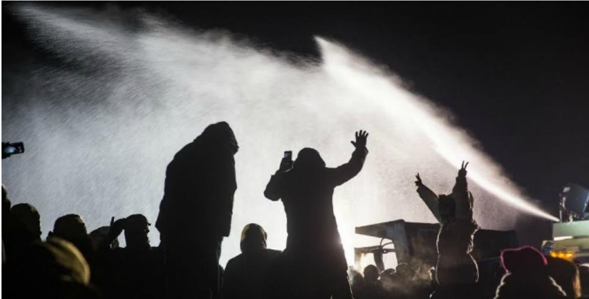
Fire hoses deployed on water protectors at the Dakota Access Pipeline protest.

On November 20, 2016 at a standoff near the Standing Rock encampment that lasted for more than six hours, police sprayed a crowd of roughly 400 protesters with water in temperatures hovering below freezing (photo below). Camp medics reported that hundreds were treated for hypothermia. Twenty-six people were hospitalized. National Lawyers Guild observers reported that several people were unconscious and bleeding after being shot by rubber bullets.