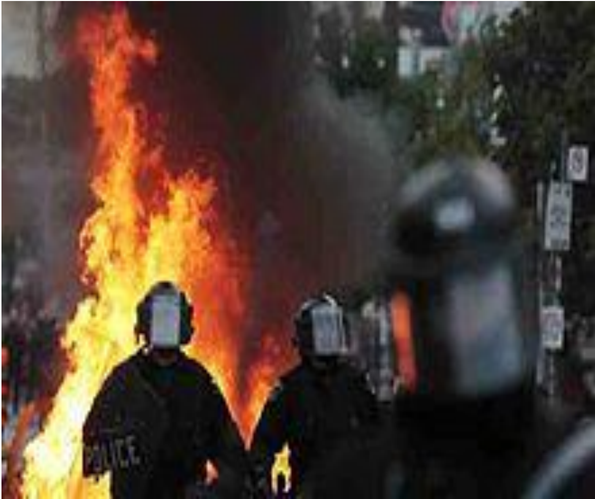
G-20 Bloc/police provoked riot – police in front of burning police vehicle, Toronto, June 26-27, 2010

This was the conduct engaged in and filmed in the G20 demonstration, which had been peaceful. A small number of black clad protesters – perhaps 100 – separated from the crowd and began torching police cars and then smashing windows. Then they removed their black outer clothing and blended in with the crowd of peaceful protesters. Some speculated that, as in the Montebello illustration, these violent demonstrators were agent provocateurs whose task it was to discredit the peaceful protesters and their objectives. The filmmaker – Joe Wenkoff - speculated that it was odd considering the 1.5 billion dollars spent on security, and the presence of approximately 20,000 police officers in the general area of the demonstration, that there wasn't a single police officer within blocks of the violence, which took place in one of the prime business areas in downtown Toronto and an area easily anticipated to be a magnet for this kind of violent demonstrator.