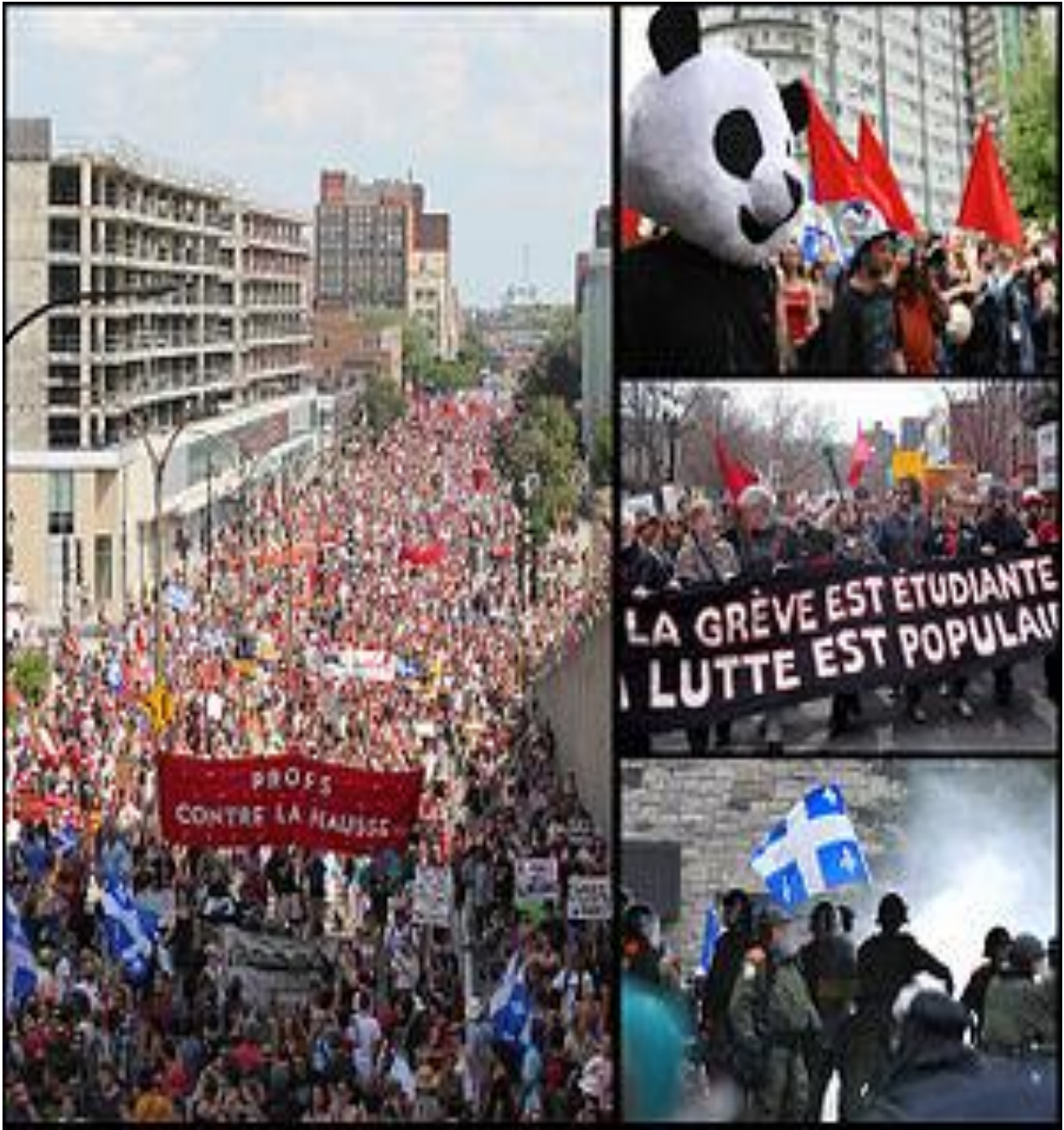
Québec Student Protests 2012